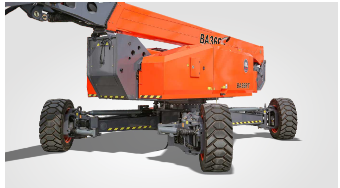
Brand New One-Key In-Situ Axle Expansion Technology Global Patent Protection